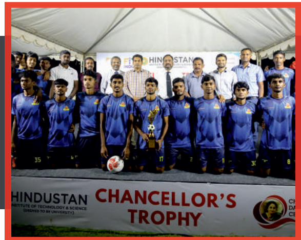
Chancellor's Trophy All India Inter Institution Tournament