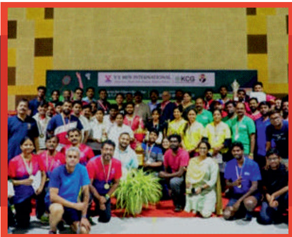
Founder's Trophy Inter Institution Badminton Tournament